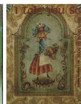
Volume 5 $60