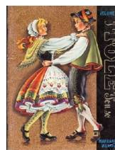
Volume 1 $45

Proceeds from the books will go to the Margaret Wehking memorial fund to help supplement the cost of an upcoming seminar to be determined at a later date.