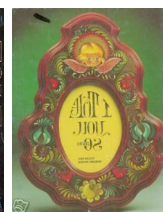
Volume 3 $80